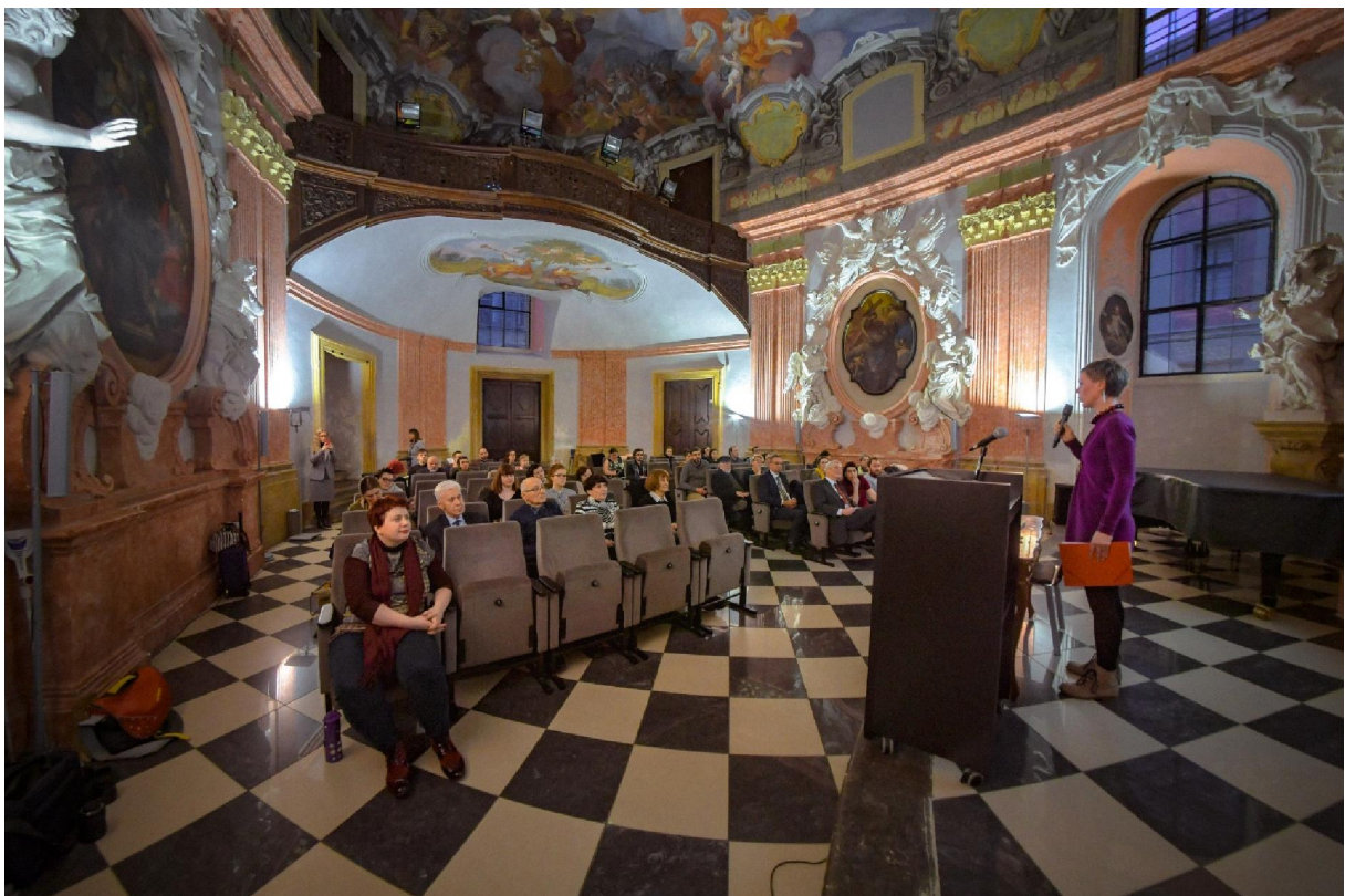
February 17, 2020